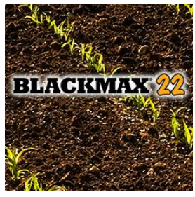
Nitrogen Management: BLACKMAX 22