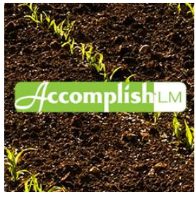
Nitrogen Management: ACCOMPLISH LM