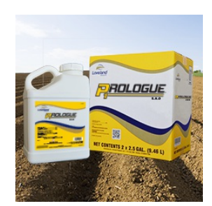
At-Planting Solutions: PROLOGUE®